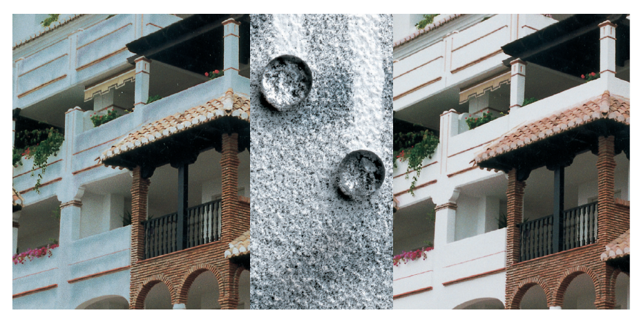
Over time, standard exterior finishes pick up and hold dirt causing a prematurely aged appearance.

Through biomimicry research and development, Stolit Lotusan exterior textured finish possesses a highly water-replellent surface similar to that of the lotus leaf. Dirt simply runs off with the water that falls on the facade with our Lotus-Effect Technology. The facade remains dry and attractive, while lowering maintenance costs by extending cleaning and recoat cycles.